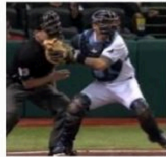
Plate umpire interference can also occur when the catcher throws the ball back to the pitcher